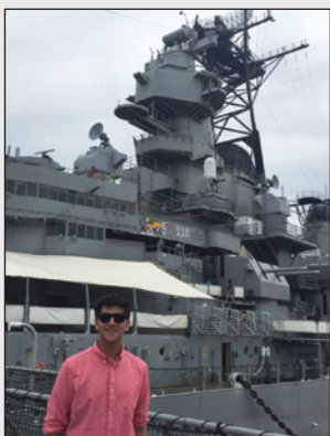
History Day Page 4