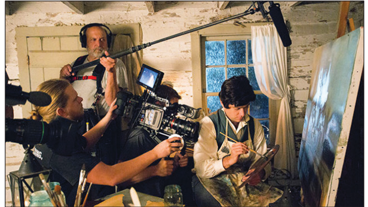
The American Artist crew creates a scene of George Caleb Bingham in his studio.

When Portillo stopped in Jefferson City on July 25, Stack met him at the Capitol to discuss Bingham's painting Watching the Cargo and the prints In a Quandary and The Jolly Flatboatmen . Intrigued by the social and political messages these artworks communicated to nineteenth-century audiences, he asked how Bingham's images of the Missouri River reflected and shaped the public's understanding of the western frontier. The episode is scheduled to air in Great Britain in early 2017. Many PBS stations in the United States are expected to broadcast the program once it is made available internationally.