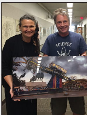
Photo Donation Page 3