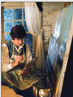
Bingham Films Page 2