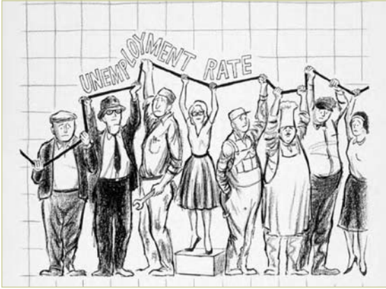
From the Tom Engelhardt Collection, drawn for the St. Louis Post-Dispatch , November 18, 1962, depicting the personal stories and real people involved in the statistical "unemployment rate."

More than 13,000 digital images of editorial cartoons drawn from 1917 through the 1970s have been digitized and placed online for easy access. The Society began collecting editorial cartoons in 1946, and this resource continues to grow with a current count of more than 21,000 works from cartoonists Daniel Fitzpatrick, Bill Mauldin, and Tom Engelhardt.