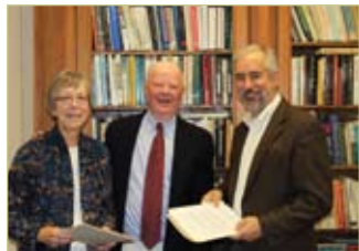
Gift of Hoberg Letters Page 4