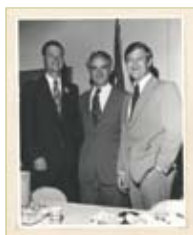
The Ike Skelton Papers Page 8