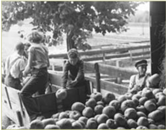
Online Photos, Art, Newspapers, Cartoons Pages 2-3