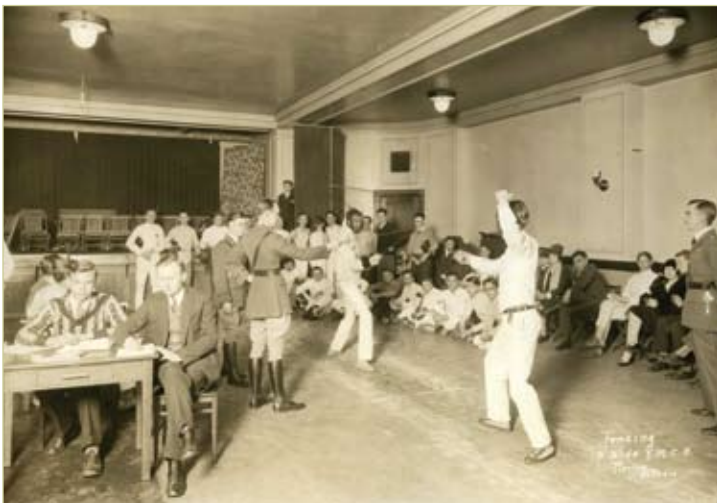
Left: An image from the YMCA Collection of a fencing class held around 1920. Above: A North Side YMCA Boys Harmonica Band performs circa 1924.