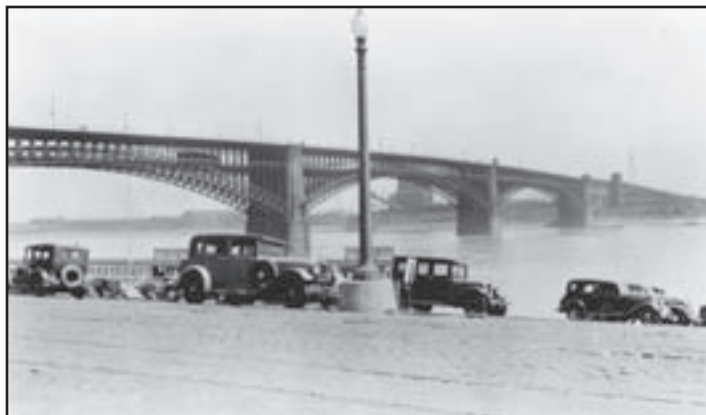
Eads Bridge and the St. Louis Levee

The inventory of the American Radio Collection can be found online at www.umsl.edu/~whmc/guides/whm0256.htm .