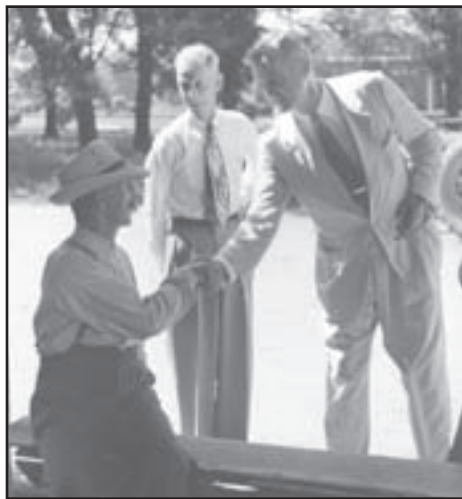
W. Stuart Symington (right)