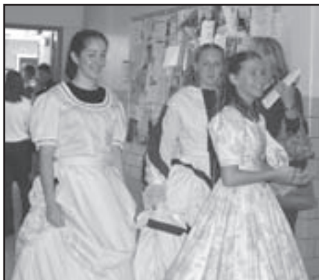
These students are excited to begin their performance at the NHDMO contest.